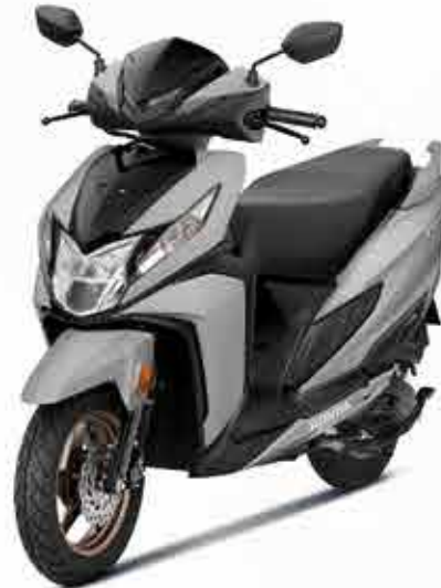
PEARL DEEP GROUND GRAY (EMBLEM)