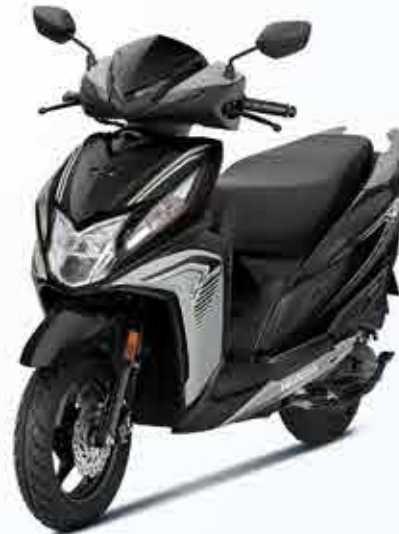
PEARL DEEP GROUND GRAY (STRIPE)